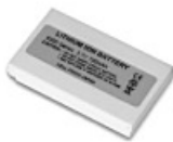
Rechargeable Lithium-ion Battery Pack