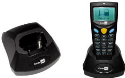
Charging & Communication Cradle